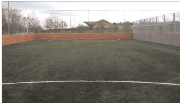
Balmedie All Weather Pitch with 3G Astroturf.

A successful partnership has enabled a fantastic new facility to be open in Balmedie. The work of locals and the Balmedie Community Planning Sub group has culminated in an all-weather football pitch made from 3rd Generation Astroturf which has the bounce